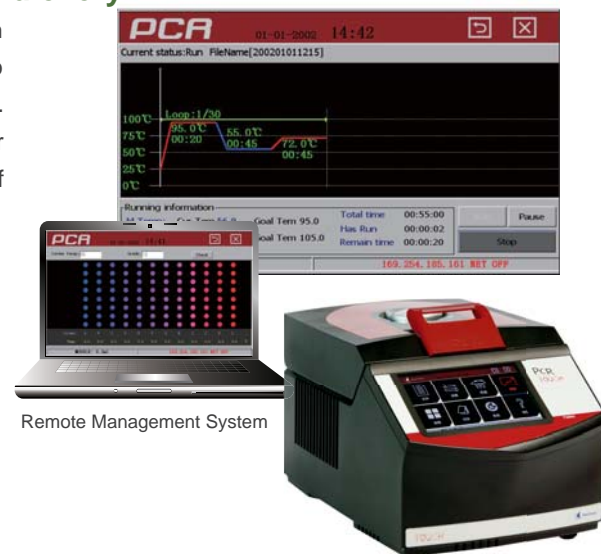
Remote Management System

Access your T960 Thermal Cyclers everywhere you go with optional Remote Management Software, which allows you to manage and monitor over 200 thermal cyclers from your computer. Create and edit methods on your computer and download from or upload to your Thermal Cyclers systems as needed. The power of the T960 Thermal Cycler is just a click away.