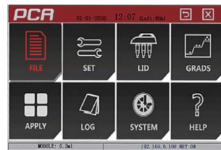
T960 Intuitive Touch Screen

The powerful, yet simple-to-operate user interface on the T960 system is driven by the 7-inch colorful touch screen. The large and intuitive graphical screen allows for real-time viewing of your temperature profiles. Additionally, the large navigation buttons put programming of the T960 Thermal Cycler at your fingertips. Set-up and navigation do not require the use of a stylus or mouse.